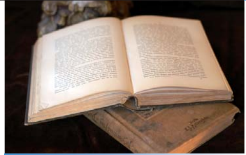
Odd Size Items - Books - Fragile Materials