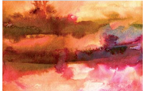
Copyshops - Reprographics - Original Artwork